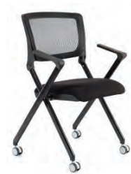
Pictured with grey/black castors