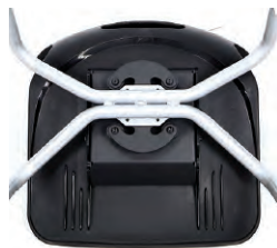
Unique 3D Mechanism

The optional 3D mounting mechanism features a unique and innovative mechanism which allows the user freedom of movement whilst seated for extended periods.